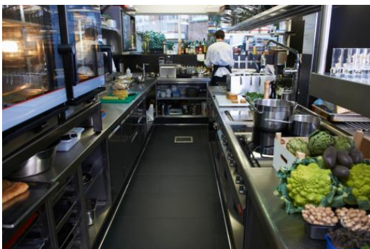
Reduced staffing levels to maintain social distancing